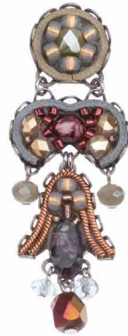
C1749 also C1749C C1749H