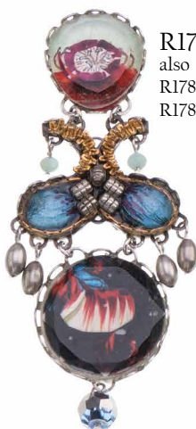
R1781 also R1781C R1781H