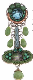
C1743 also C1743C C1743H