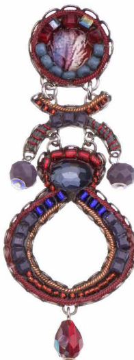
C1761 also C1761C C1761H