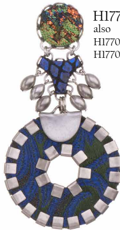
H1770 also H1770C H1770H