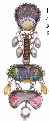
R1798 also R1798C R1798H