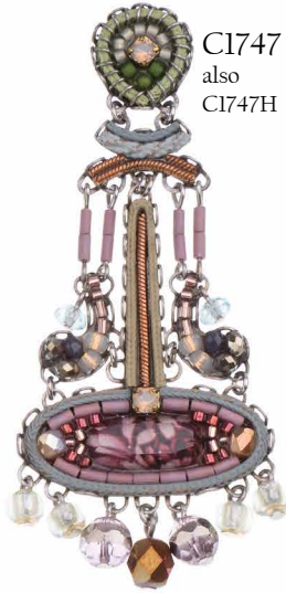
C1747 also C1747H