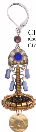
C1736 also C1736A