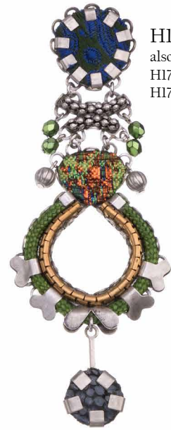
H1769 also H1769C H1769H