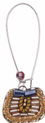
C1738 also C1738A C1738C