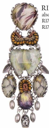
R1788 also R1788C R1788H