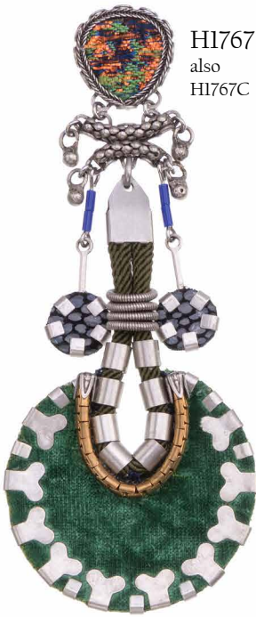
H1767 also H1767C