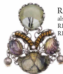
R1790 also R1790C R1790H