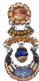
C1735 also C1735H