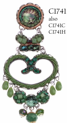
C1741 also C1741C C1741H