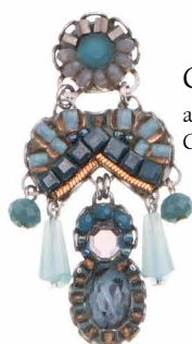
CI757 also CI757H