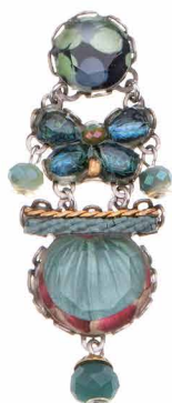
R1805 also R1805H