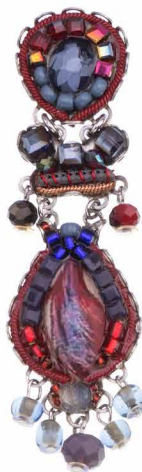
C1762 also C1762C C1762H