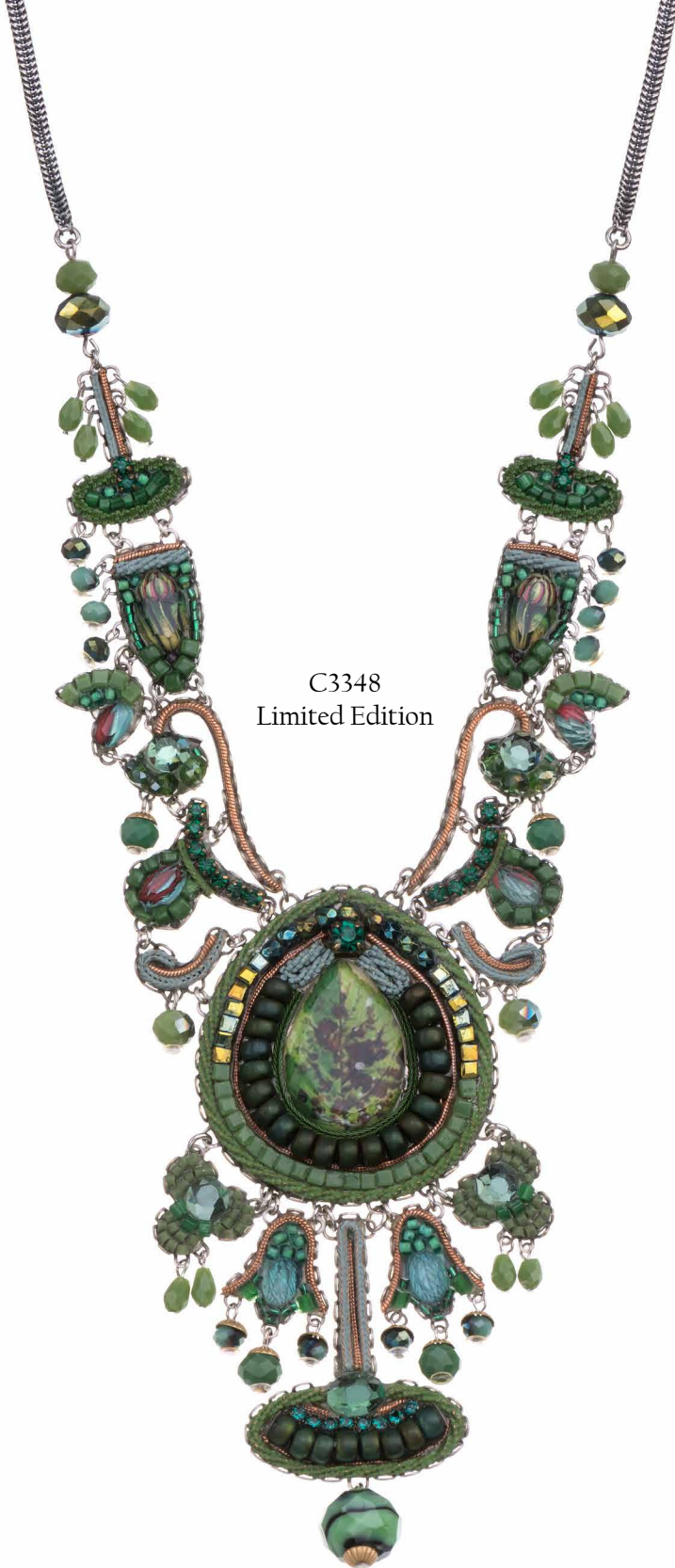
C3348 Limited Edition