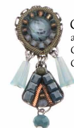
CI759 also CI759C CI759H