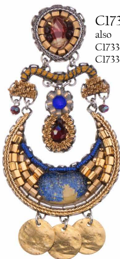
C1733 also C1733C C1733H