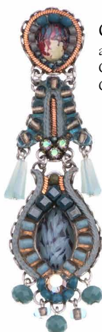
CI755 also CI755C CI755H