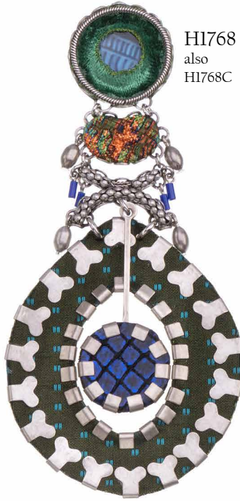
H1768 also H1768C