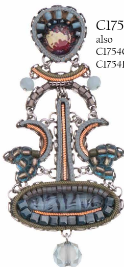
CI754 also CI754C CI754H