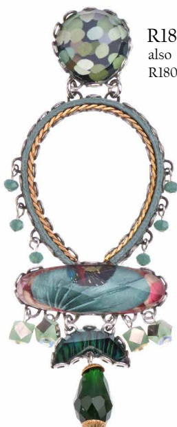
R1802 also R1802C