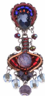
C1763 also C1763C C1763H