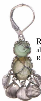
R1793 also R1793A