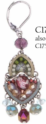
C1750 also C1750A