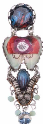
R1782 also R1782C R1782H