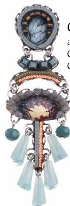
CI756 also CI756C CI756H