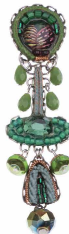
C1742 also C1742C C1742H