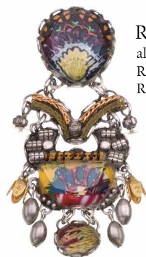
R1797 also R1797C R1797H