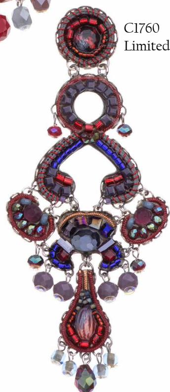
C1760 Limited Edition