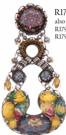
R1795 also R1795C R1795H