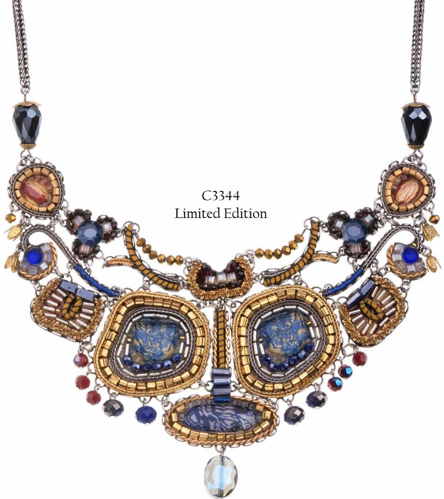
C3344 Limited Edition