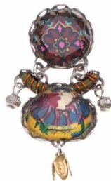
R1800 also R1800C R1800H