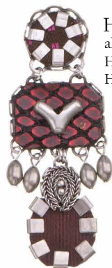
H1777 also H1777C H1777H