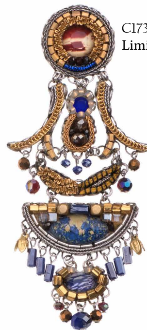
C1732 Limited edition