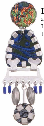
H1771 also H1771C H1771H