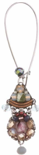
C1751 also C1751A