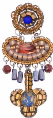
C1734 also C1734C C1734H