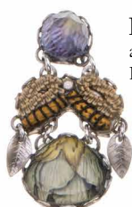
R1792 also R1792H