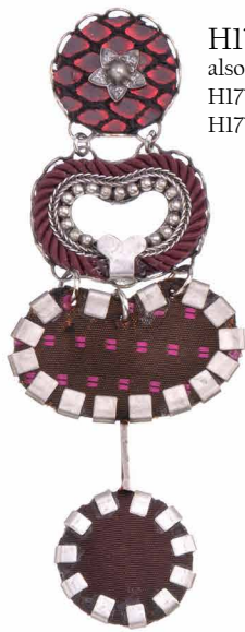
H1775 also H1775C H1775H