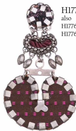
H1776 also H1776C H1776H