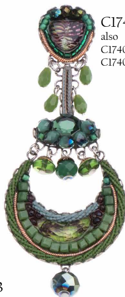
C1740 also C1740C C1740H