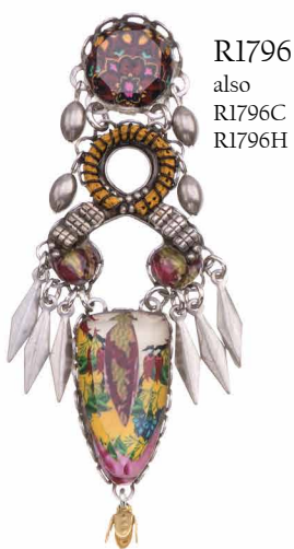
R1796 also R1796C R1796H