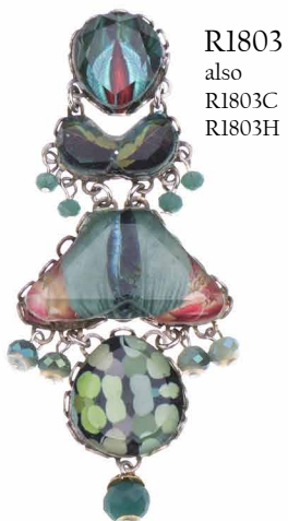
R1803 also R1803C R1803H