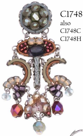
C1748 also C1748C C1748H