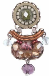
C1752 also C1752C C1752H