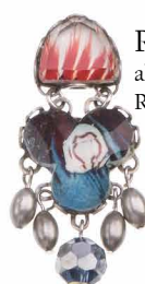
R1786 also R1786H