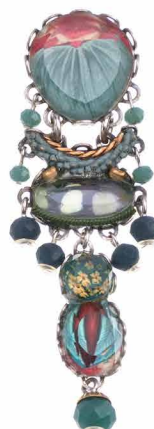
R1804 also R1804C R1804H